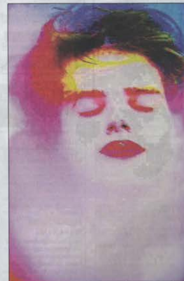
David Macke explores "performative masculinity" in this archival pigment print, "Hiller's Bathroom."